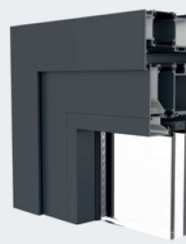
DOOR SASH CORNER