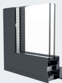
WINDOW SASH CORNER