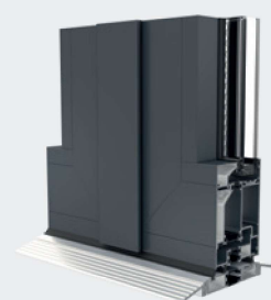
DOUBLE DOOR MEETING STYLE & LOW THRESHOLD